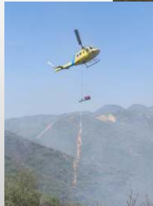
Heli-torch prescribed burn using Flash 21

A two-part liquid gelling agent solution which provides a fast, reliable gelling time. One case contains 12 liters of product that can be mixed with straight gasoline, diesel, AVGas, Jet A or B Fuels (or combinations of fuels).