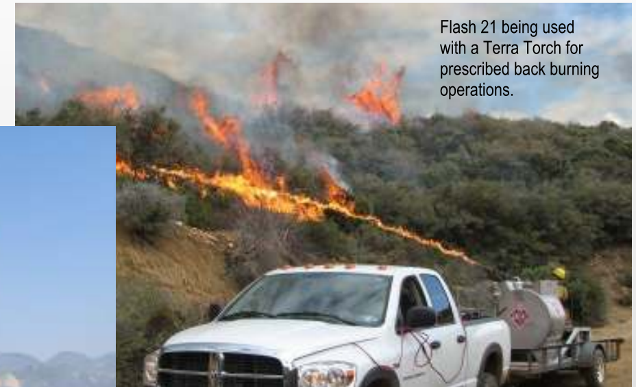
Flash 21 being used with a Terra Torch for prescribed back burning operations.

One standard case includes 6 x 1 L Bottles of Flash 21A and 6 x 1 L Bottles of Flash 21B which treats up to 300 US Gallons of fuel!